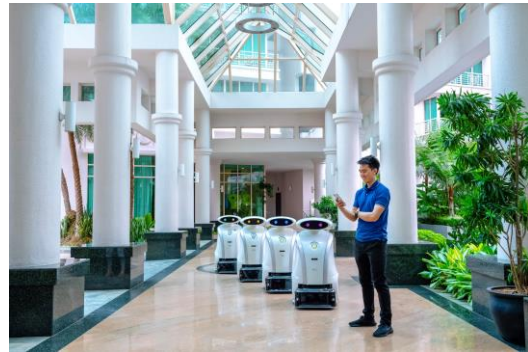
Cleaning COBOT, LeoScrub, doing its work

Read the full article: COBOTS (Collaborative Robot) in the Cleaning Industry - LionsBot