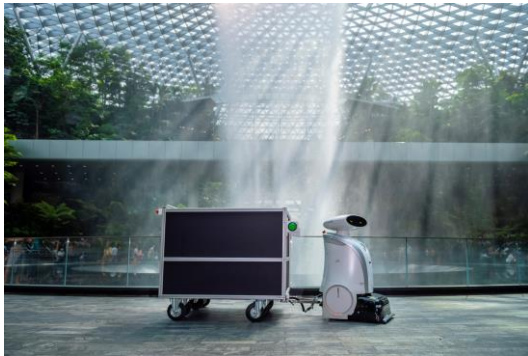
Waste pulling COBOT, LeoPull, at Jewel